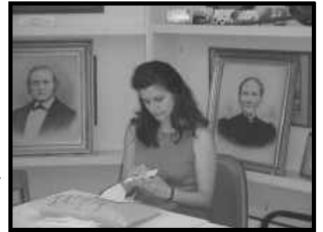
The new Director hard at work!