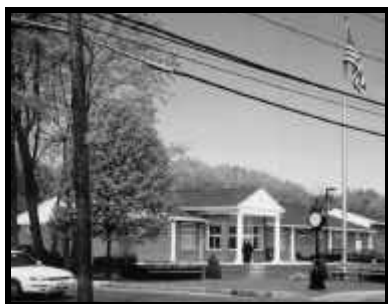
Greenlawn Post Office Today