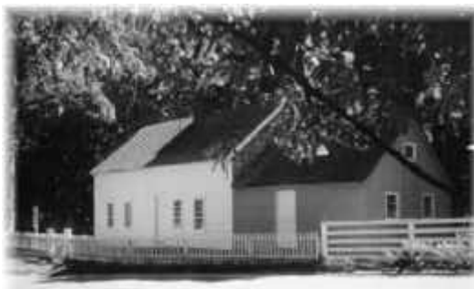
The Suydam Homestead located on Centerport Rd and Rte 25A

Please visit our 1730 Suydam House and Barn/Museum in historic Greenlawn-Centerport this weekend!;