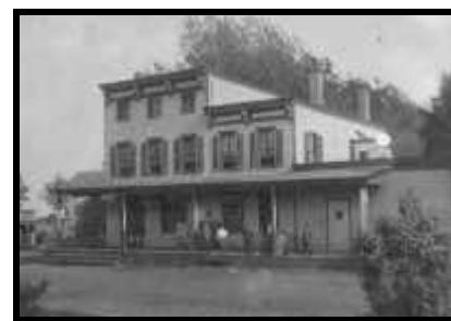
Greenlawn Post Office 1872-c1900