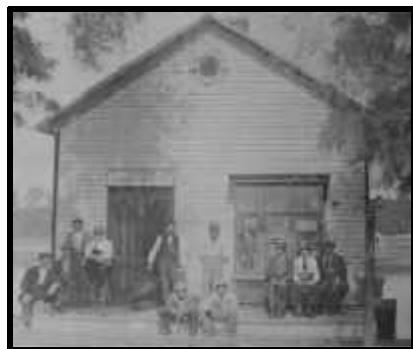
Centerport Post Office 1880-1899