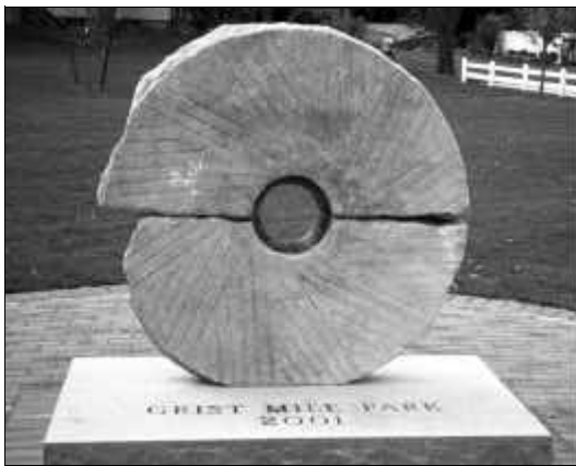
The Millstone Stone Restored