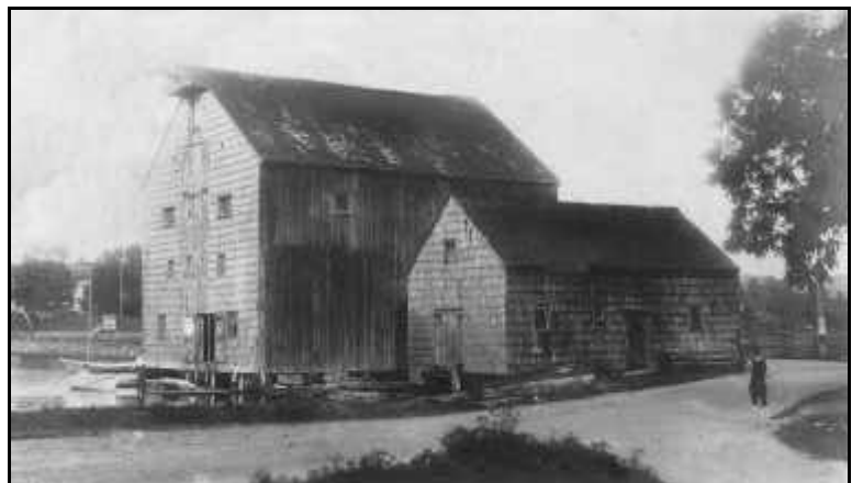
The Centerport Grist Mill, built in 1774, as it appeared c1908

The park in its short lived history has already become a very popular spot locally for rest and contemplation.;